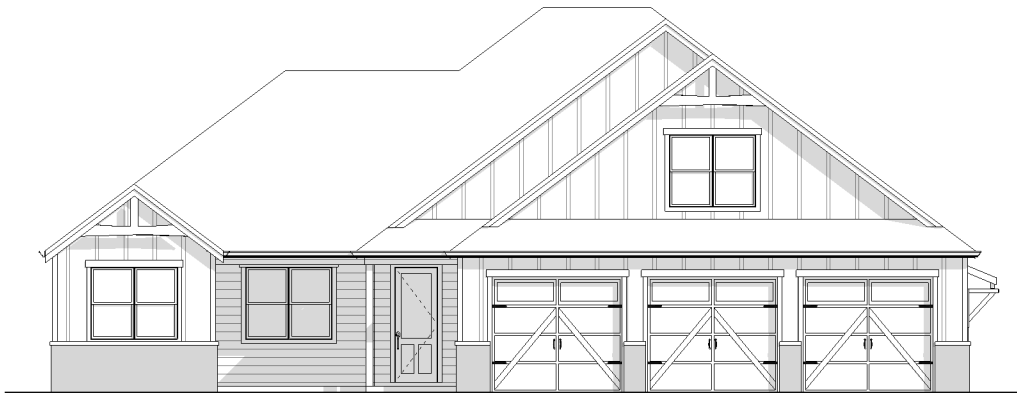
PLAN - 2540 SQFT