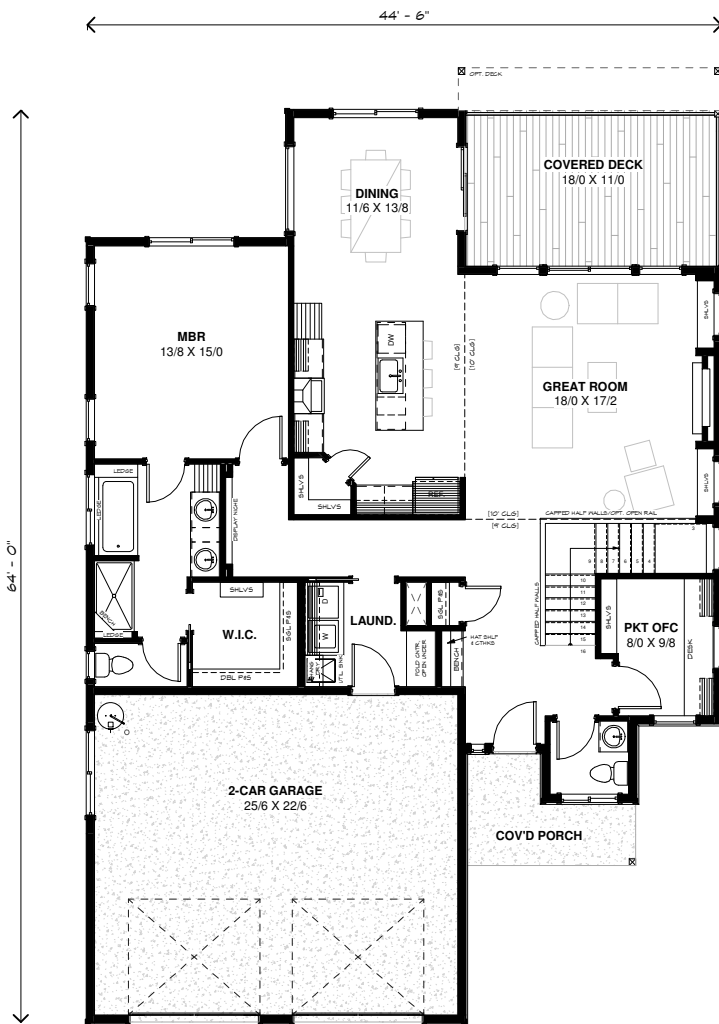
MAIN FLOOR PLAN 1/4" = 1'-0"