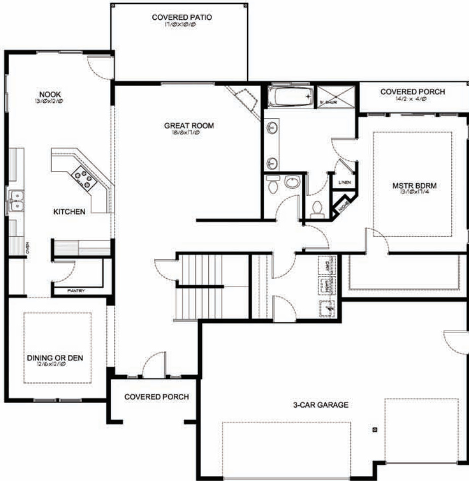
MAIN FLOOR PLAN 3442